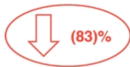
Dramatic Stock Price Decline