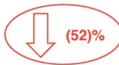
Sharply Negative Total Shareholder Return